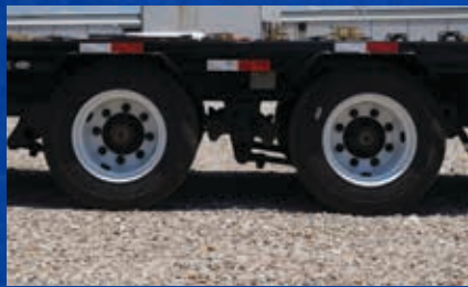
ST215/75 R17.5 W&T