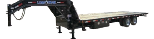
THE GT SERIES