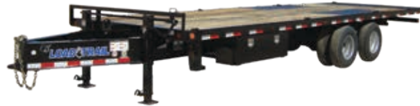
THE PT SERIES