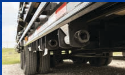
RATCHETS W/SLIDE TRACK