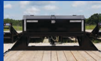
TOP RISER TOOLBOX