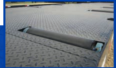
18" IN-DECK ROLLERS