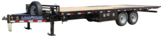
THE PE SERIES