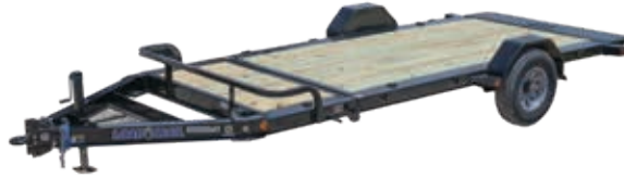
THE TH SERIES (single axle)