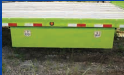
72" SIDE-MOUNT TOOLBOX