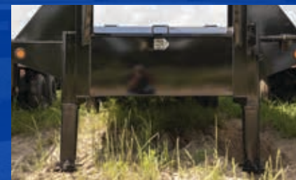
25K DROP-LEG JACKS