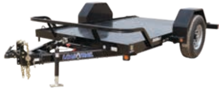
THE SH SERIES

We take pride in what we build because you deserve the best.