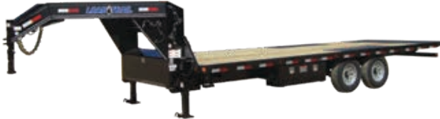
THE GE SERIES