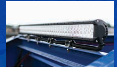
LED LIGHT BAR