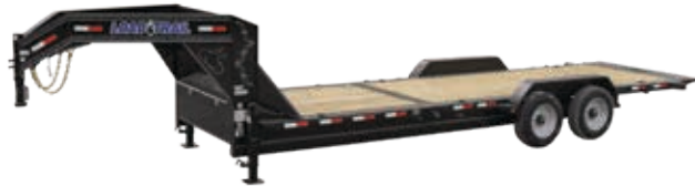
THE GN SERIES