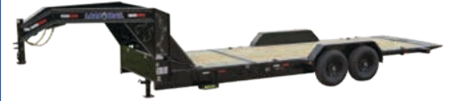
THE GN SERIES