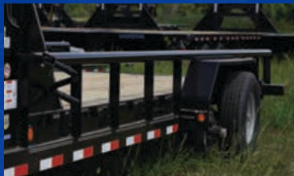
3" PIPE-TOP SIDE RAILS