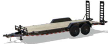
THE CH SERIES