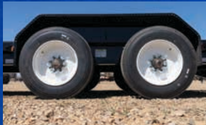
ST215/75 R17.5 W&T