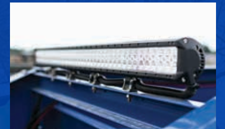
LED LIGHT BAR