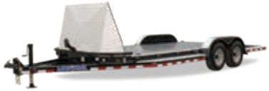
THE CZ SERIES