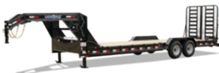
THE GC SERIES