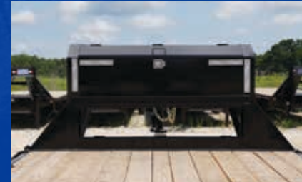
TOP RISER TOOLBOX