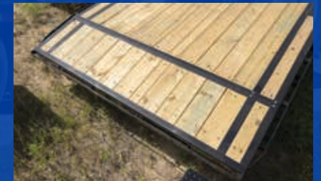
2' DOVE TAIL