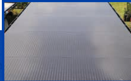
1/8" STEEL DP FLOOR