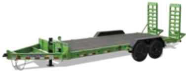
THE CB SERIES