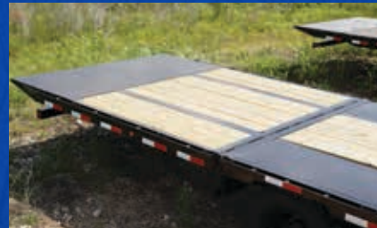
10FT HYD. DOVE