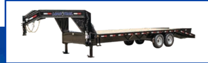
THE GH SERIES