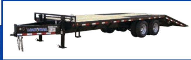
THE PR SERIES