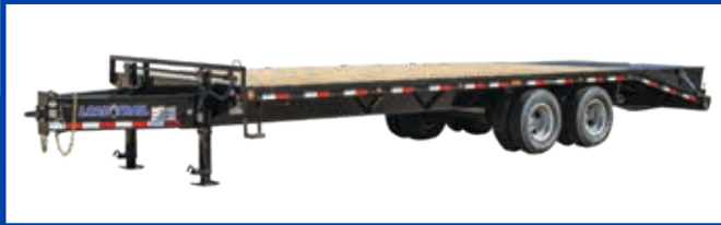
THE PH SERIES

We know how important it is to have a dependable, rugged and durable trailer. Load Trail's Heavy-Duty Deckover series is engineered and built for the long haul. Whether you're in transportation, construction or on the farm, Load Trail's Heavy-Duty Deckover series can handle whatever you throw at it, and more. Take advantage of Load Trail's broad selection of customizations and take your trailer to the next level. We take pride in what we build because you deserve the best.