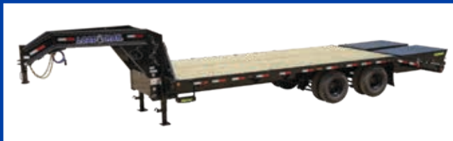
THE GH SERIES