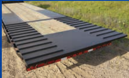
OUTER CLEATS ON DOVE