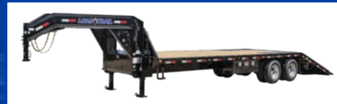
THE GR SERIES